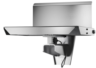
iL Special 150T/SP

Our verifiable load receptor iL Special 150T/SP is available in different weighing ranges, as a dual range scale and dual interval scale. The load receptor supports all Bizerba weighing terminals.